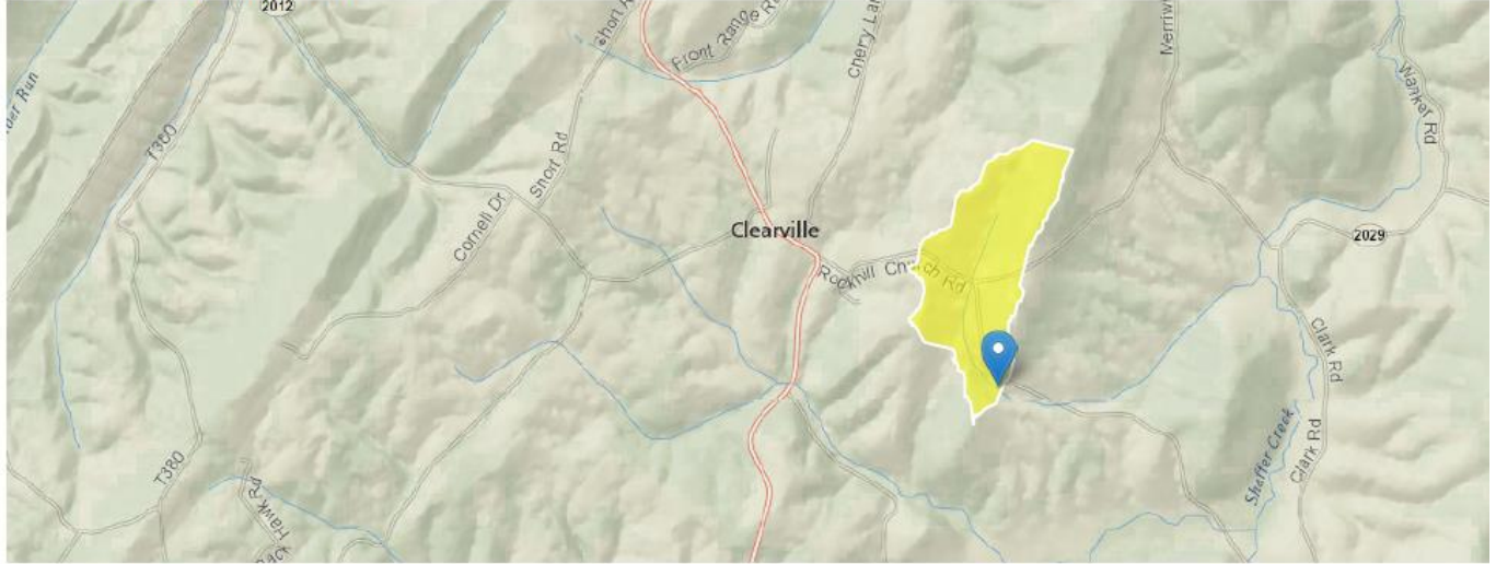
Perchard Residence PA0260746 Modeling Point #1 May 2023

Region ID: PA Workspace ID: PA20230523174523677000 Clicked Point (Latitude, Longitude): 39.91033, -78.37280 Time: 2023-05-23 13:45:48 -0400