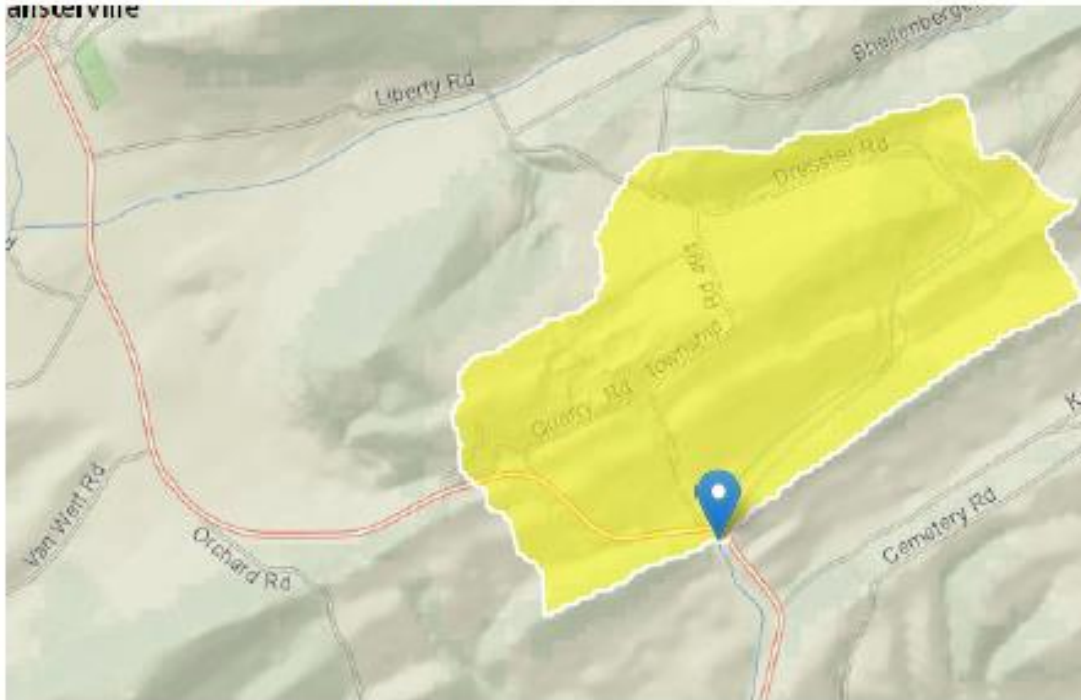
Kerstetter Residence PA0261157 Modeling Point #1 July 2020

Region ID: PA Workspace ID: PA20200715134020628000 Clicked Point (Latitude, Longitude): 40.61785, -77.24137 Time: 2020-07-15 09:40:39 -0400