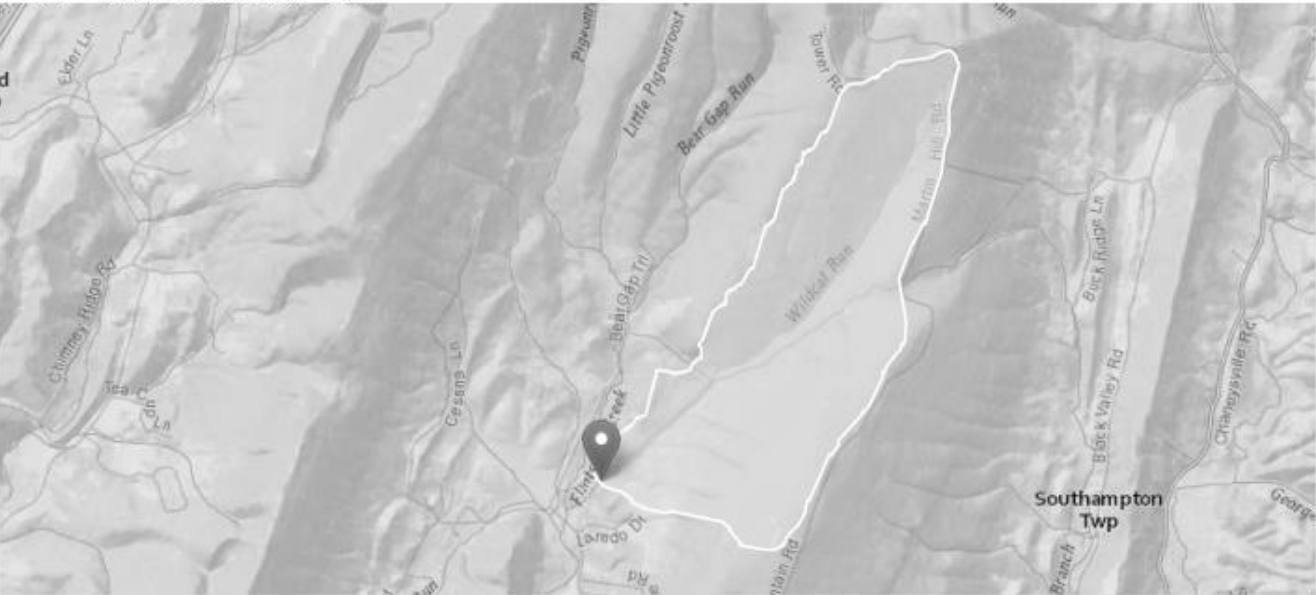
Logue Residence PA0261254 Modeling Point #1 October 2024

Region ID: PA Workspace ID: PA20241004131741729000 Clicked Point (Latitude, Longitude): 39.79452, -78.57237 Time: 2024-10-04 09:18:04 -0400