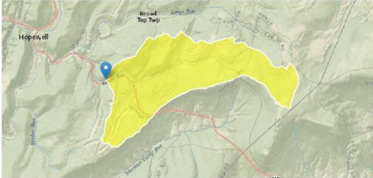
Broad Top Township- Miller Residence PA0266825 Modeling Point #1 August 2023

Region ID: PA Workspace ID: PA20230821182208464000 Clicked Point (Latitude, Longitude): 40.12326, -78.24109 Time: 2023-08-21 14:23:19 -0400