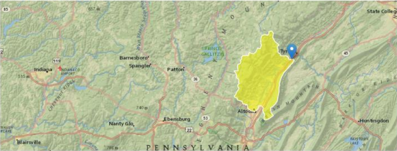
Bonsell residence PA0267121 Modeling Point #1 February 2025

Region ID: PA Workspace ID: PA20250226162216061000 Clicked Point (Latitude, Longitude): 40.65645, -78.25688 Time: 2025-02-26 11:22:43 -0500