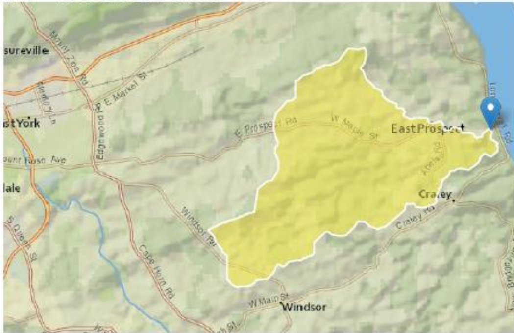
Shipley Residence PA0267228 Modeling Point #1 March 2021

Region ID: PA Workspace ID: PA20210312133138794000 Clicked Point (Latitude, Longitude): 39.96995, -76.49542 Time: 2021-03-12 08:31:57 -0500