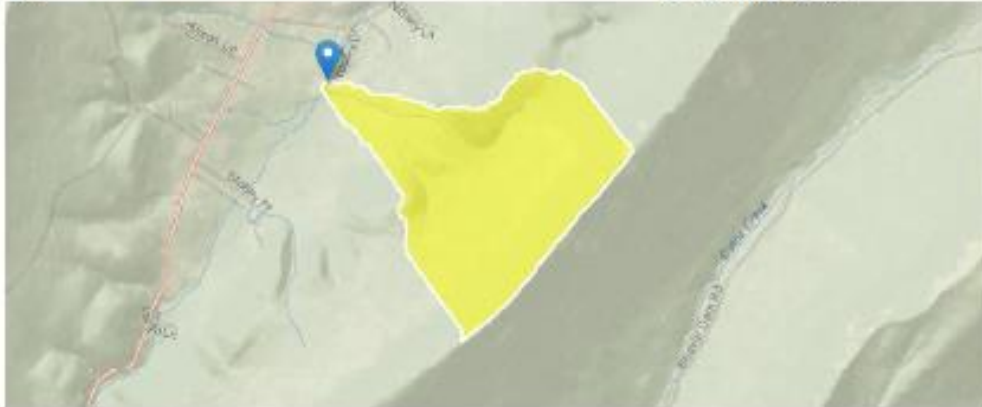
Shonna Blair Residence PA0267414 Modeling Point #1, February 2021

Region ID: PA Workspace ID: PA20210225162127489000 Clicked Point (Latitude, Longitude): 40.54904, -78.27853 Time: 2021-02-25 11:21:43 -0500