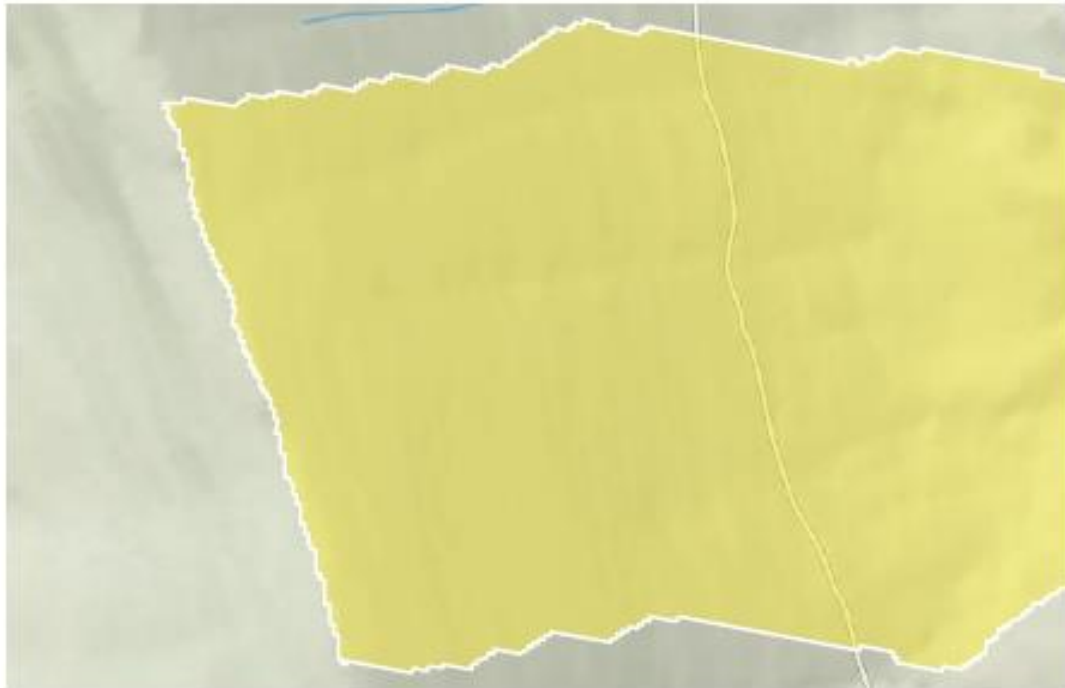
Omer Hazlett Residence PA0281808 Modeling Point #1 March 2021

Region ID: PA Workspace ID: PA20210304192555661000 Clicked Point (Latitude, Longitude): 40.38407, -78.33698 Time: 2021-03-04 14:26:12 -0500