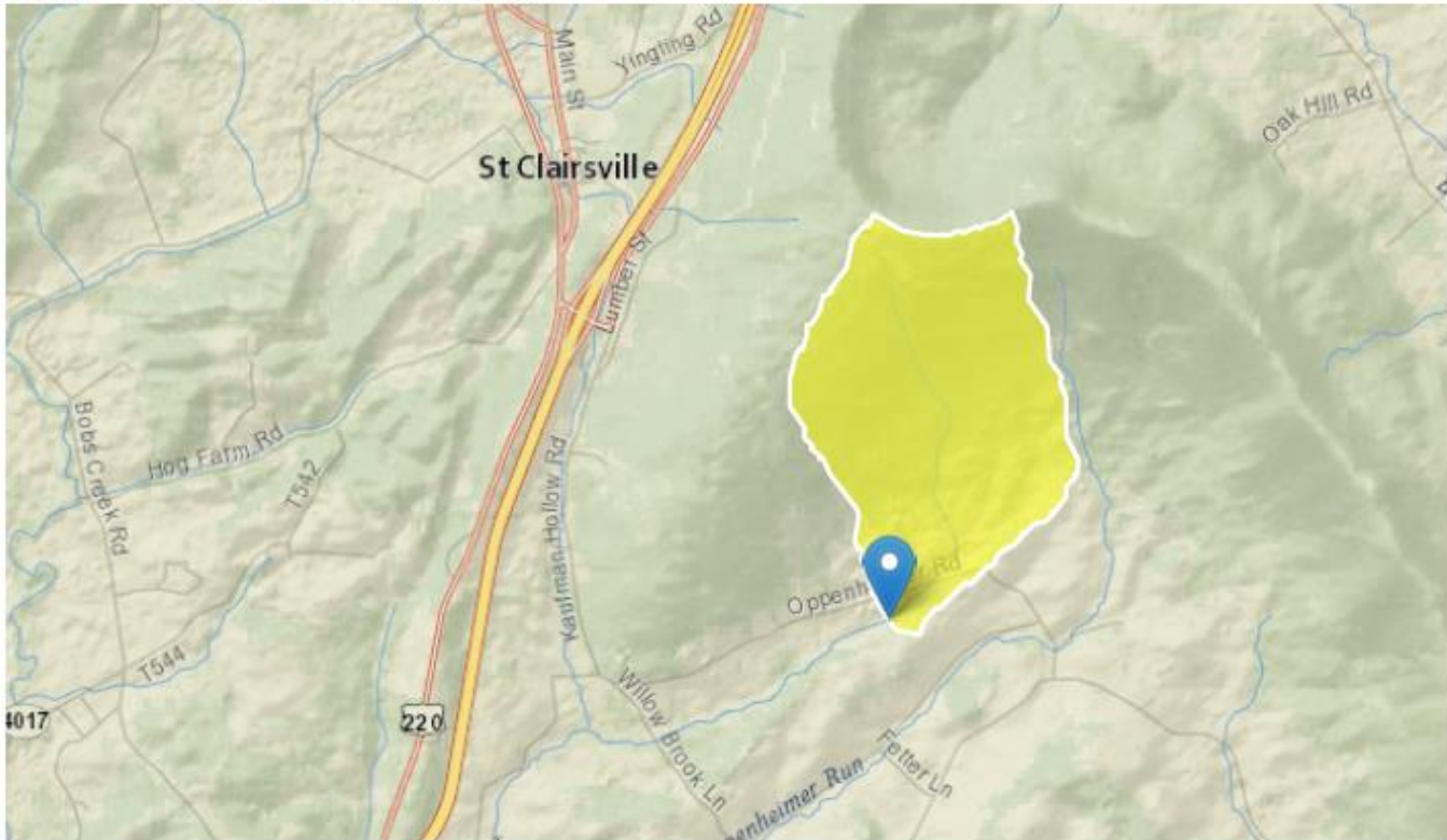
Baer Residence PA0294004 Modeling Point #1 April 2023

Region ID: PA Workspace ID: PA20230412131905567000 Clicked Point (Latitude, Longitude): 40.12764, -78.48489 Time: 2023-04-12 09:19:24 -0400