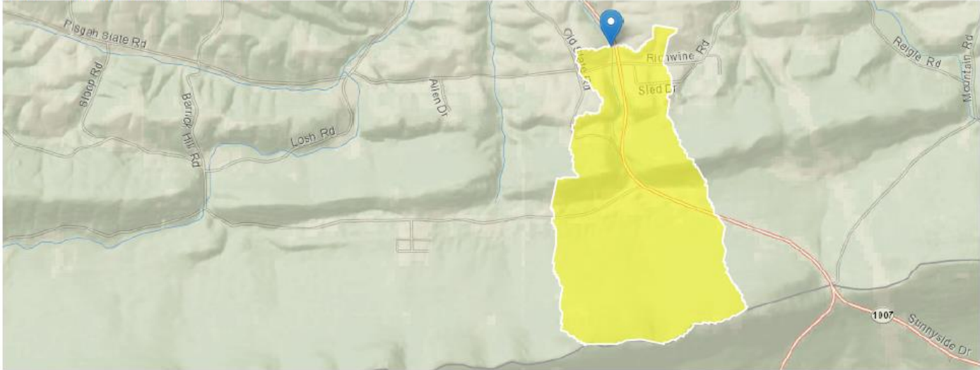
English Residence PA0294063 Modeling Point #1 May 2023

Region ID: PA Workspace ID: PA20230505163318150000 Clicked Point (Latitude, Longitude): 40.31211, -77.15353 Time: 2023-05-05 12:33:38 -0400