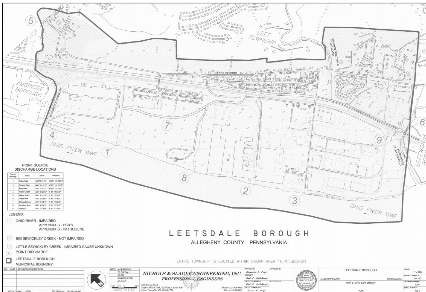
Figure 1. Leetsdale Borough Storm Sewer System Map

DEP will publish notice of the receipt of the NPDES permit application and a tentative decision to issue the individual NPDES permit in the Pennsylvania Bulletin in accordance with 25 Pa. Code § 92a.82. Upon publication in the Pennsylvania Bulletin , DEP will accept written comments from interested persons for a 30-day period (which may be extended for one additional 15-day period at DEP's discretion), which will be considered in making a final decision on the application. Any person may request or petition for a public hearing with respect to the application. A public hearing may be held if DEP determines that there is significant public interest in holding a hearing. If a hearing is held, notice of the hearing will be published in the Pennsylvania Bulletin at least 30 days prior to the hearing and in at least one newspaper of general circulation within the geographical area of the discharge.