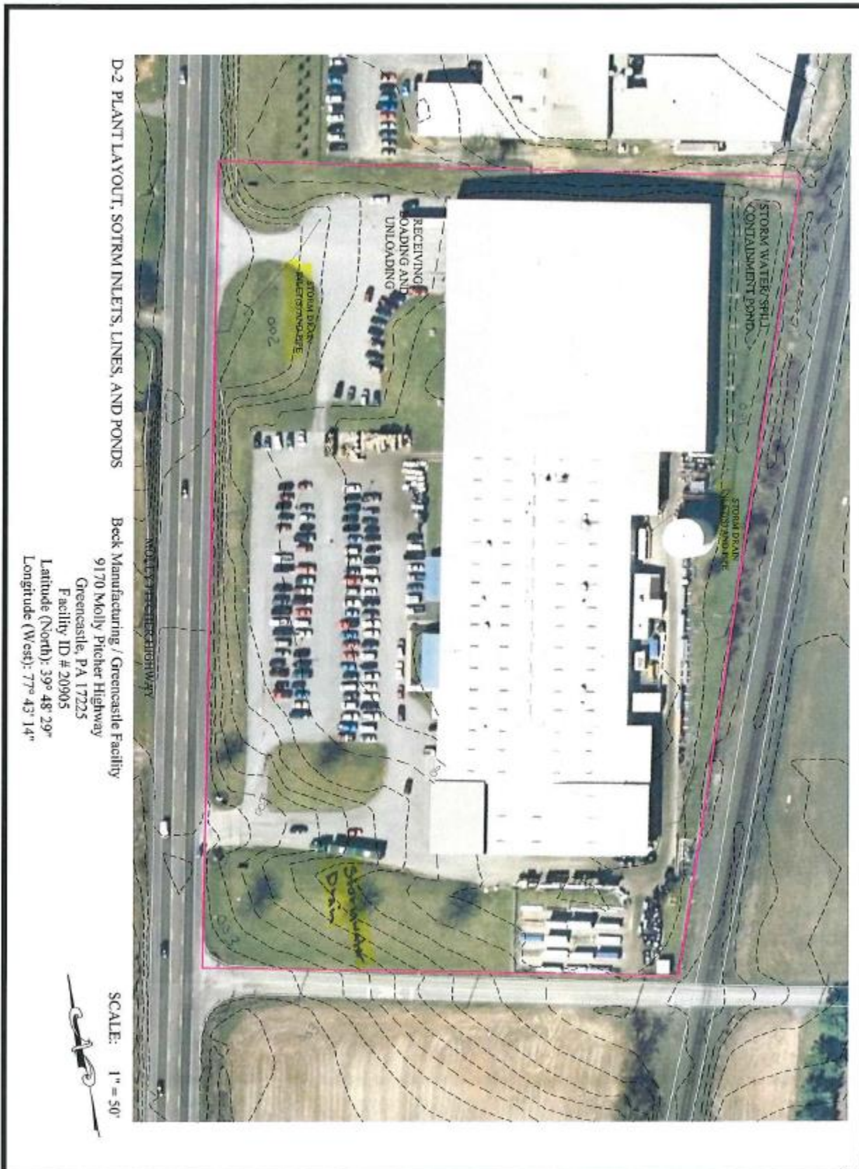
Figure 3. Site Layout