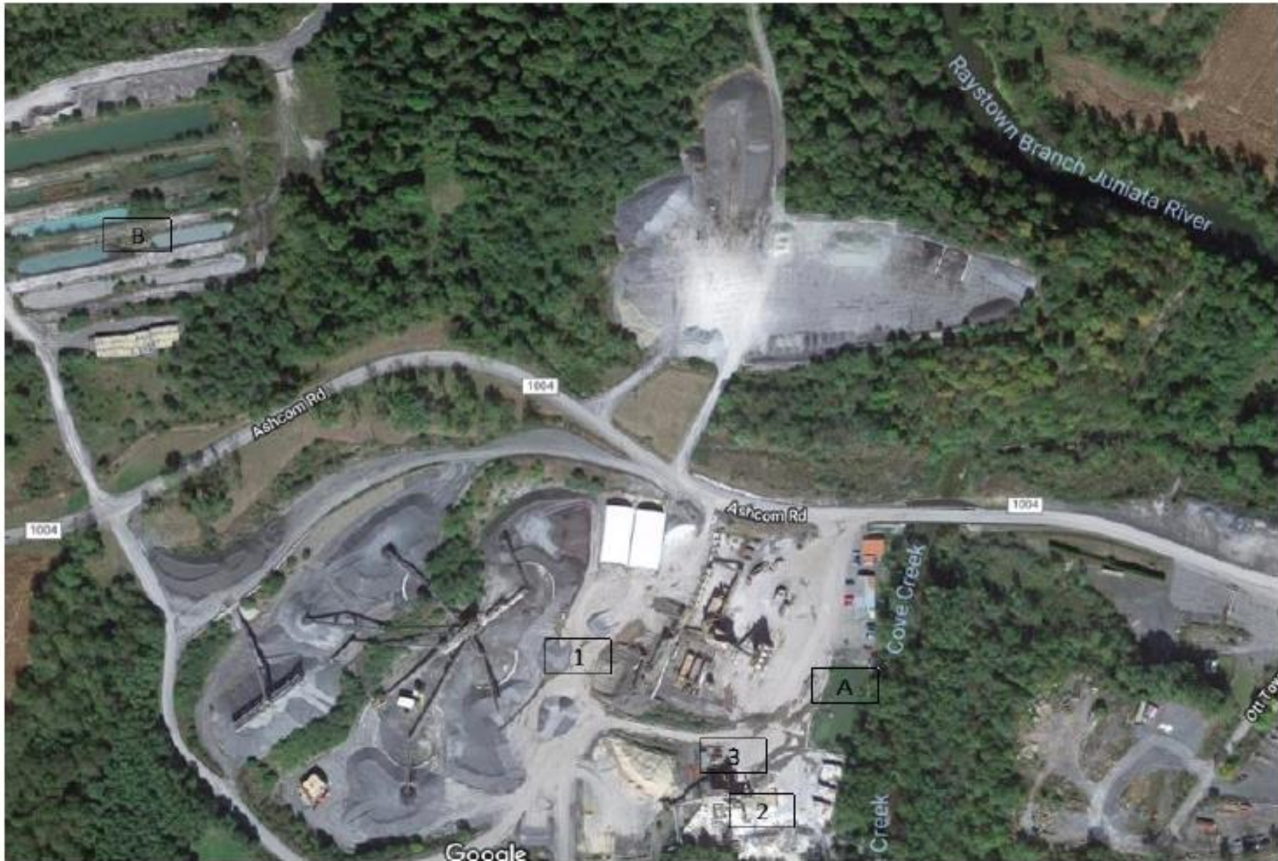
Figure 5. Process Water Areas (from 3/23/2018 TD Letter)