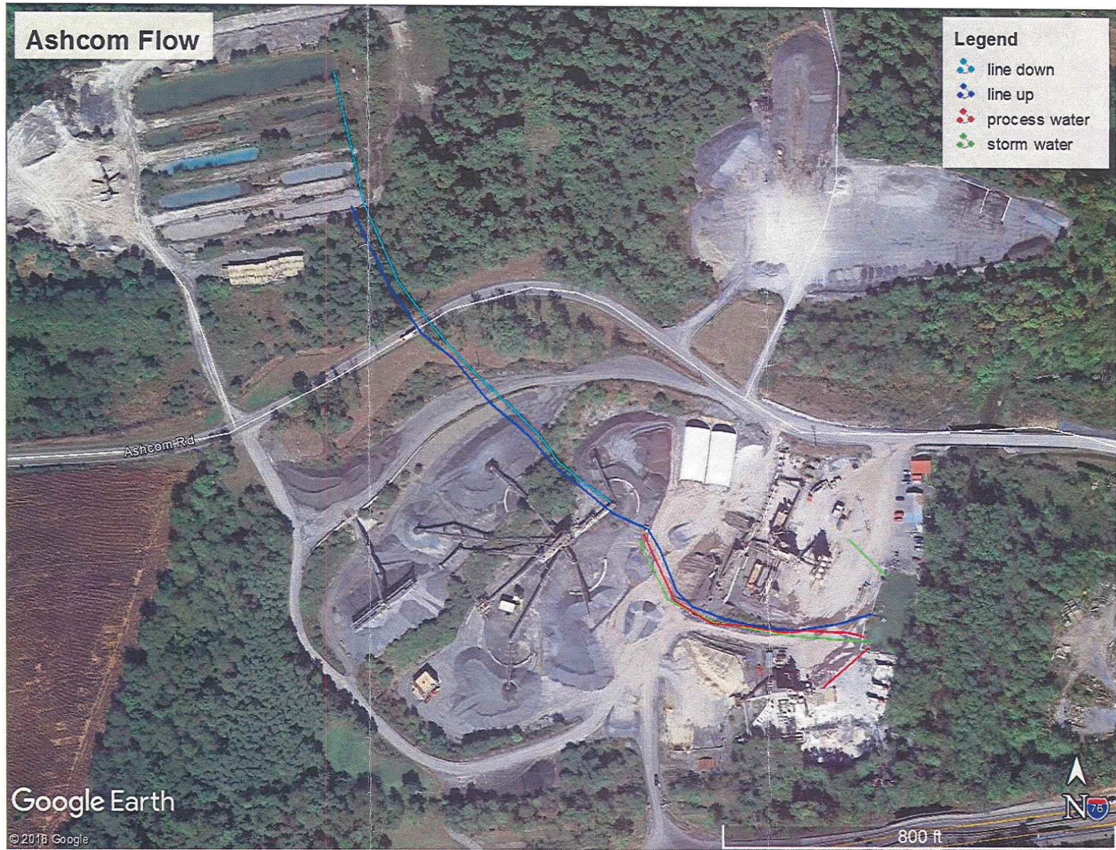
Figure 4. Flow drawing for the stormwater and wastewater that includes upper recycling ponds. Received February 5, 2018