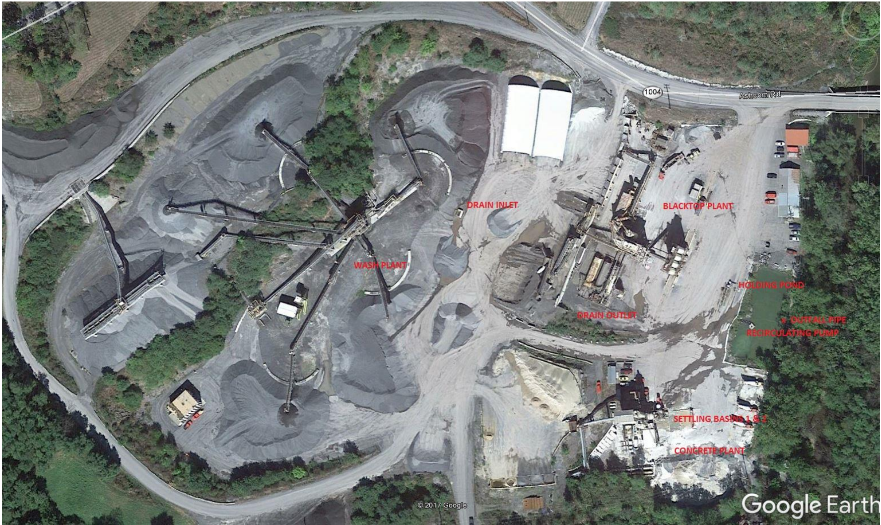
Figure 3. Site plan received from NESL via email 9/15/2017 in response to 9/13/2017 TD email.