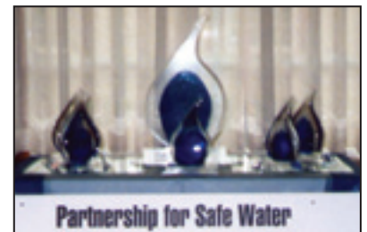
Phase III Crystal Water Drop Awards