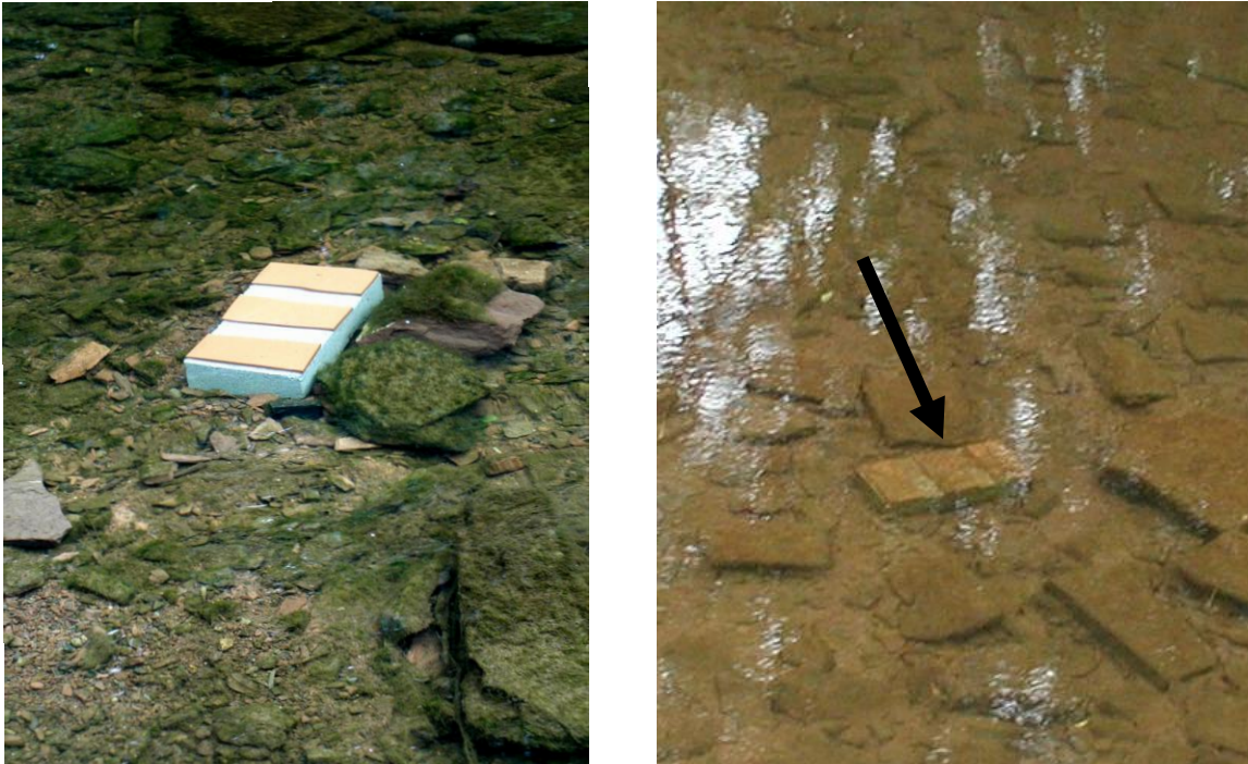
Figure 2. Example Clay tiles to be used as artificial substrate in Phase 2. Left photo taken day of deployment, right photo after 14 days growth

Six additional sample locations will be added to the three Phase 1 locations. Two of the three sondes at each Phase 1 site will be moved to the Phase 2 sites with one sonde being left to continue recording at Phase 1 sites. Locations for Phase 2 samples are still being chosen, but the sites will be matched to previously completed YOY studies where diseased fish were found or at sites identified as nutrient enriched sections of the river during flyovers.